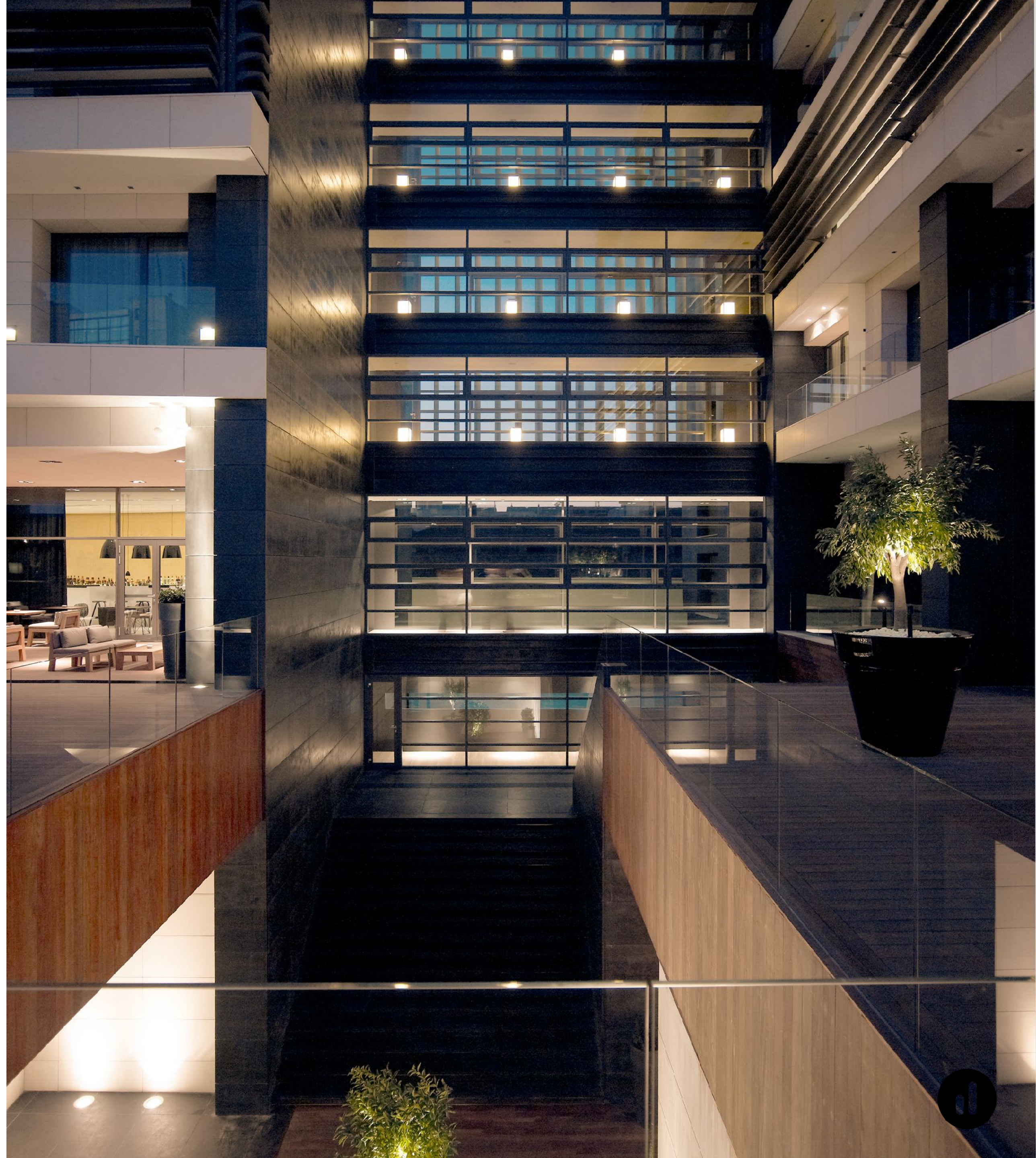
Architecture Zege: Zeppos - Georgiadi + Associates Interior Design Zege: Zeppos - Georgiadi + Associates, Andy Martin Studio