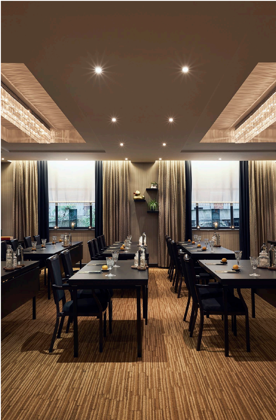
MICE Meeting rooms