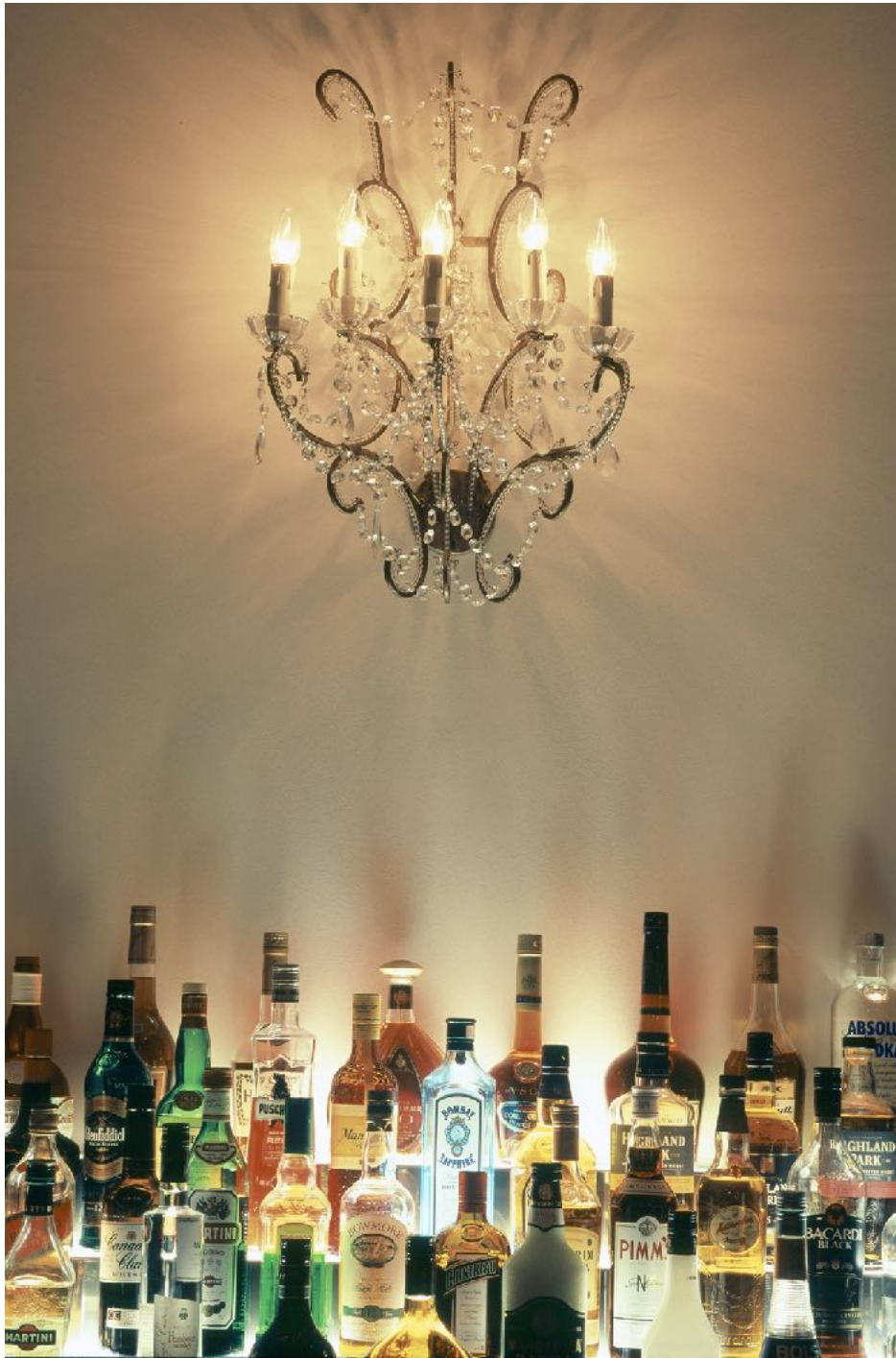
Food & Beverage Restaurant