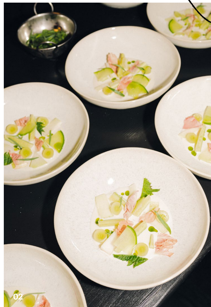
02