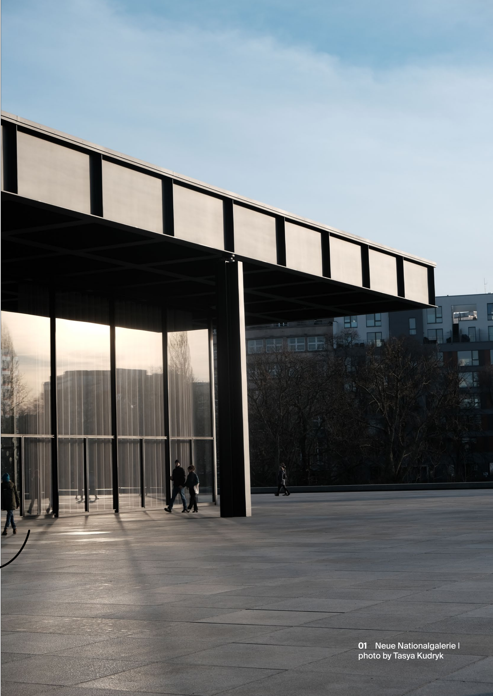
01 Neue Nationalgalerie I photo by Tasya Kudryk

Find all locations and more information in our online map